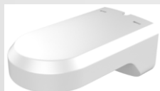
DS-2CD1294ZJ Wall mount